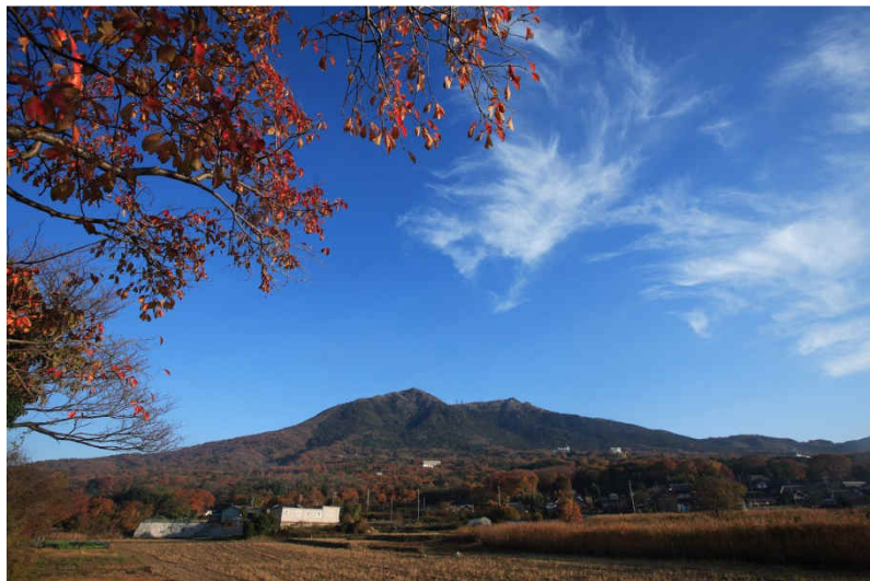
Autumn Leaves in Mount Tsukuba, 45 min from Venue

We plan to hold the FOSS4G-ASIA 2018 from October to November. The first candidate is from 31st October to 2nd November, the second is 27th November to 29th November. This is one of the most beautiful and suitable season not only for conference but also for sightseeing, especially for autumn leaves in mountains. In current plan, we will hold a day for hands-on session, and 2 days for oral presentation and poster session.