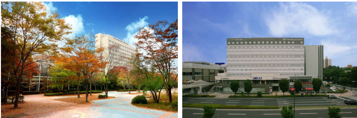
Okura Frontier Hotel Tsukuba Epochal and Daiwa Roynet Hotel Tsukuba