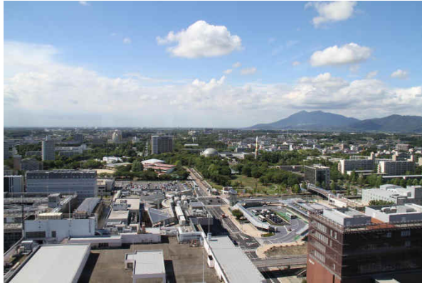
Central Area of Tsukuba